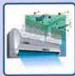
Active Carbon Electrostatic Filter