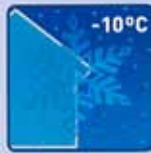
Low Ambient Kit