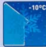
Low Ambient Kit