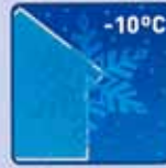
Low Ambient Kit