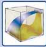
Two direction Air Vane Technology