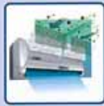
Active Carbon Electrostatic Filter